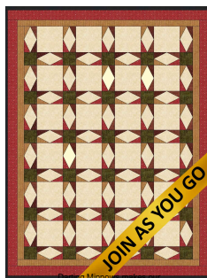
Autumn Stars quilt quick and fun to make. Stitching your blocks in the hoop means incredibly perfect stars without cutting or stitching a single triangle

This design features JAYGO - Join As You Go. You will actually join your quilt blocks into rows while they are still in your embroidery hoop.